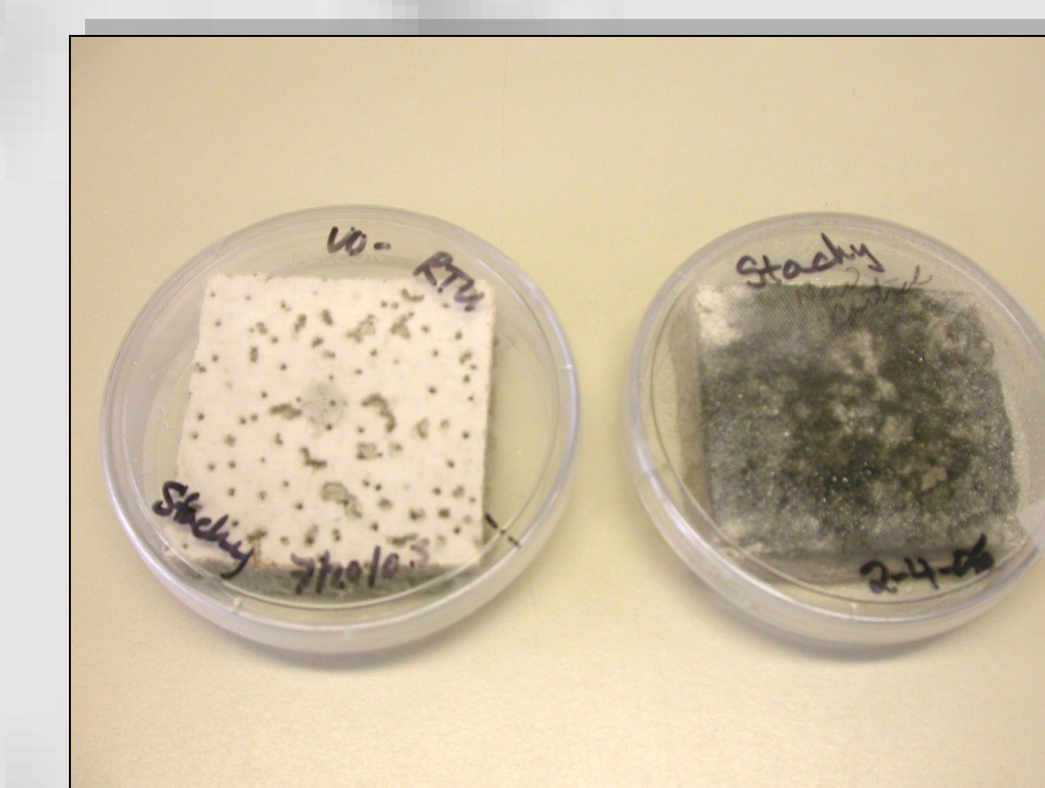
Pretreatment of ceiling tiles with VO-RTU inhibited growth of Stachybotrys after 7 months following treatment. Ceiling tile saturated with VO-RTU in July 2005 was inoculated with Stachybotrys spore suspension on 4 Feb 2006. Control tile was inoculated at the same time.

Colony diameter of various fungi growing on saturated SRS. Treated squares were sprayed with VO-PS 2 to 3 weeks after inoculation. Final measurements and observations were made 5 to 7 weeks after spraying